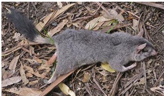
Brush Tailed Phascogale

6. The area provides habitat for Chuditch and Brush Tailed Phascogale. Clearing of land and the introduction of cats and dogs will have a disastrous impact on these animals.